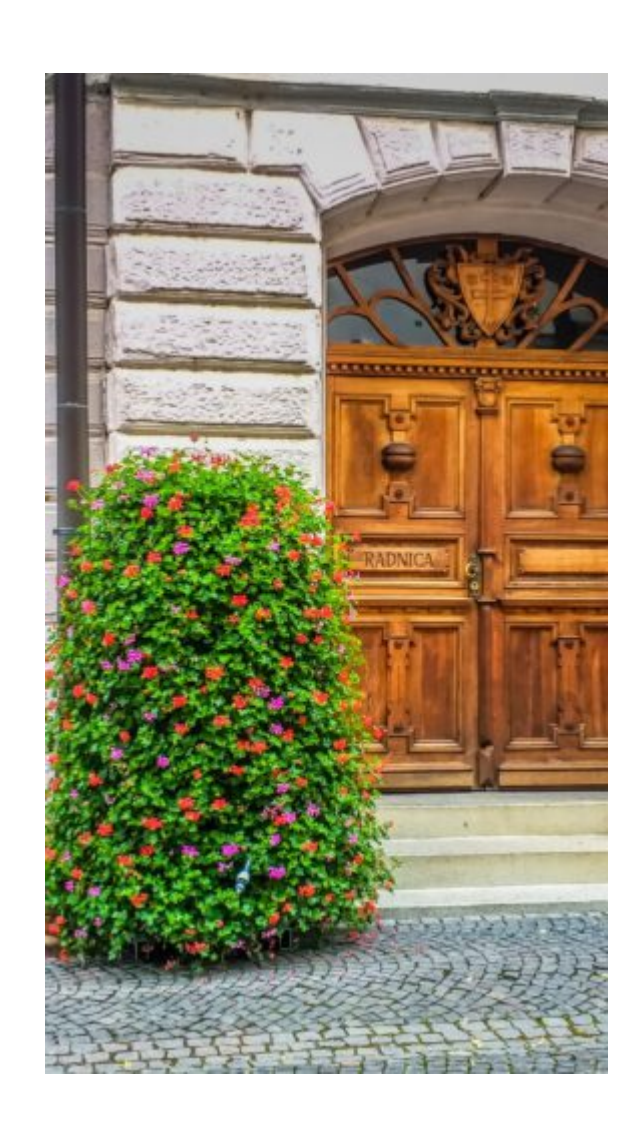
Žilina, Slovakia

already mentioned squares. The main market called Mariánske námestie is also full of floral compositions in various colour shades. Those 2 meter high half models of <u>Flower Towers</u> can be seen also close to the town hall — the special models of the products can be easily situated along walls without any space loss.