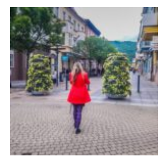
Žilina, Slovakia