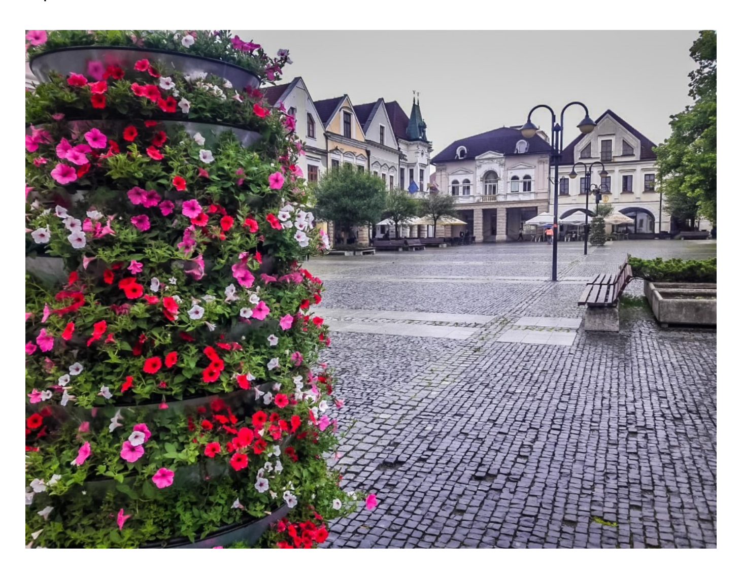
Žilina, Slovakia

On the longest pedestrian zone in Slovakia, there are two bustling squares with picturesque tenement buildings and a fountain. You will find there also a lot of restaurants with local rarities and some idyllic space to relax. In the lovely centuries-old place, you cannot miss the <u>floral decoration</u> which introduces and emphasizes the charming colours of the squares.