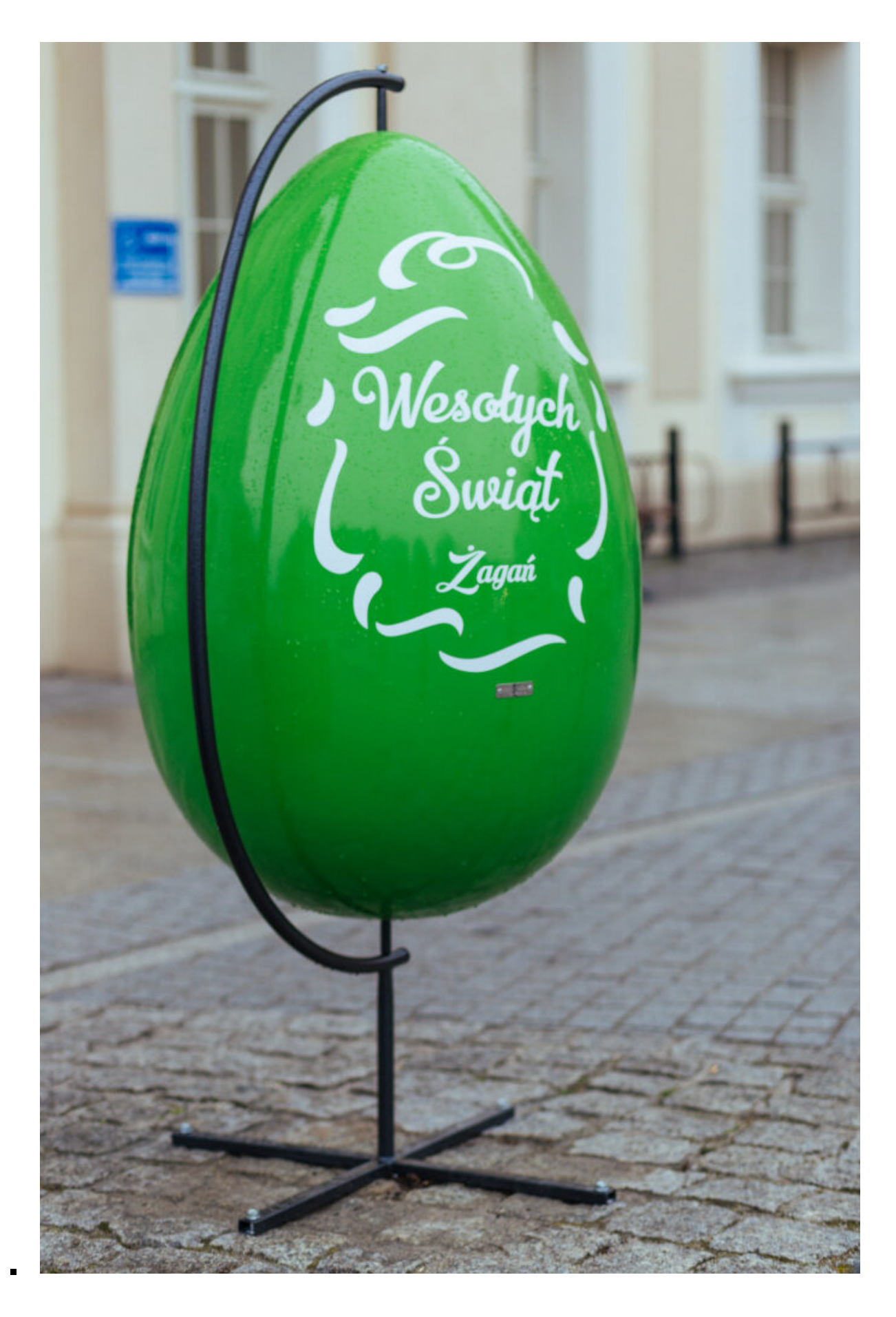
Big Easter Eggs are a great base for creative residents and local artists to show their skills. The smooth surface of