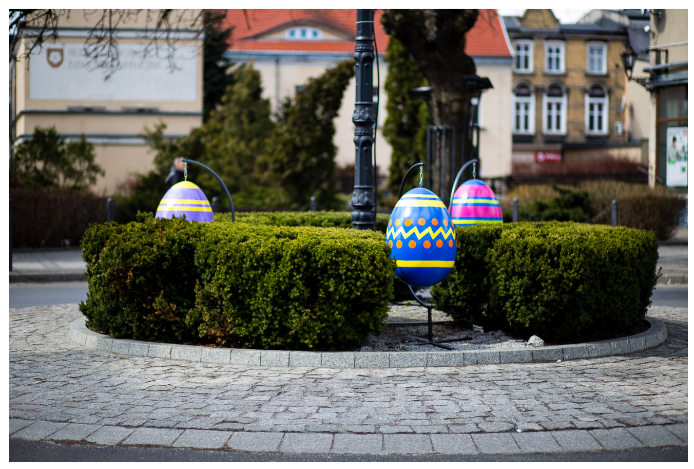
Patterned decorative Easter eggs on a roundabout.

tourists, tempted by interesting light illuminations and Christmas installations, go for a walk and take photos. Nothing prevents colorful urban decorations from appearing on streets and in squares also in spring. It is the huge <a href="Easter">Easter</a> <a href="Eggs">Eggs</a> on special decorative frames that become the most interesting element of space when winter slowly fades into oblivion. Their fabulous colors effectively add some new glow to the neighborhood, and remind residents of the city: Easter is just around the corner!