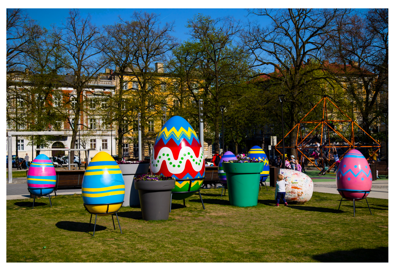
Composition of large Easter eggs with large pots — Gorzów.

but also for special needs, our company offers really gigantic ones. The largest are up to 150 centimeters high. The choice is truly wide and thanks to this, everyone can find large Easter Eggs perfectly suited to their needs. The smaller ones can be arranged in a pyramid and placed in a Gianto pot or hung on a lamp. Also, it can become a great solution for an Easter installation in shopping malls or hotels. Over one meter high decorative Eggs will be perfect on a promenade, square or roundabout. They are so large that even without additional decorations cannot be overlooked. However, the Eggs look even better in compositions.