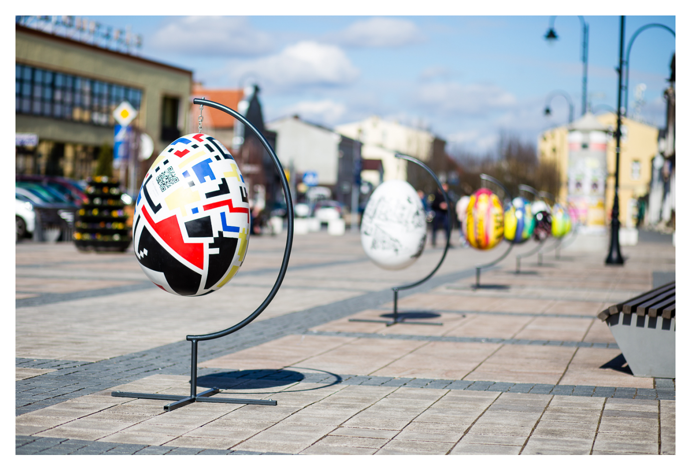
Gallery of great Easter Eggs in Kórnik.

decorative Easter Eggs is a perfect canvas for the youngest, who will be happy to join the action of decorating the space together. However, there are more ideas: the city symbol of Easter can become a tool for promoting local artists, and squares can transform into open art galleries — just like in Kórnik in Wielkopolskie voivodship.