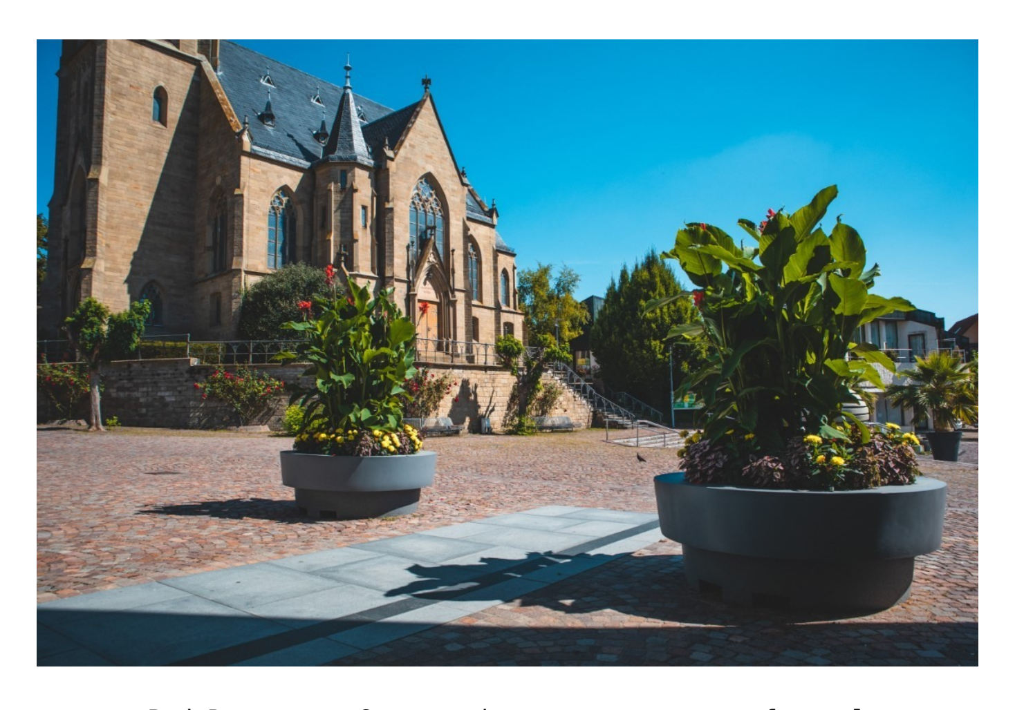
Bad Rappenau, Germany

There is such a risk. In really vast places, large plants, shrubs or ornamental trees will work best as they stand out from the market squares, becoming their most beautiful decorations. But how do you bring such demanding specimens to cobbled areas?