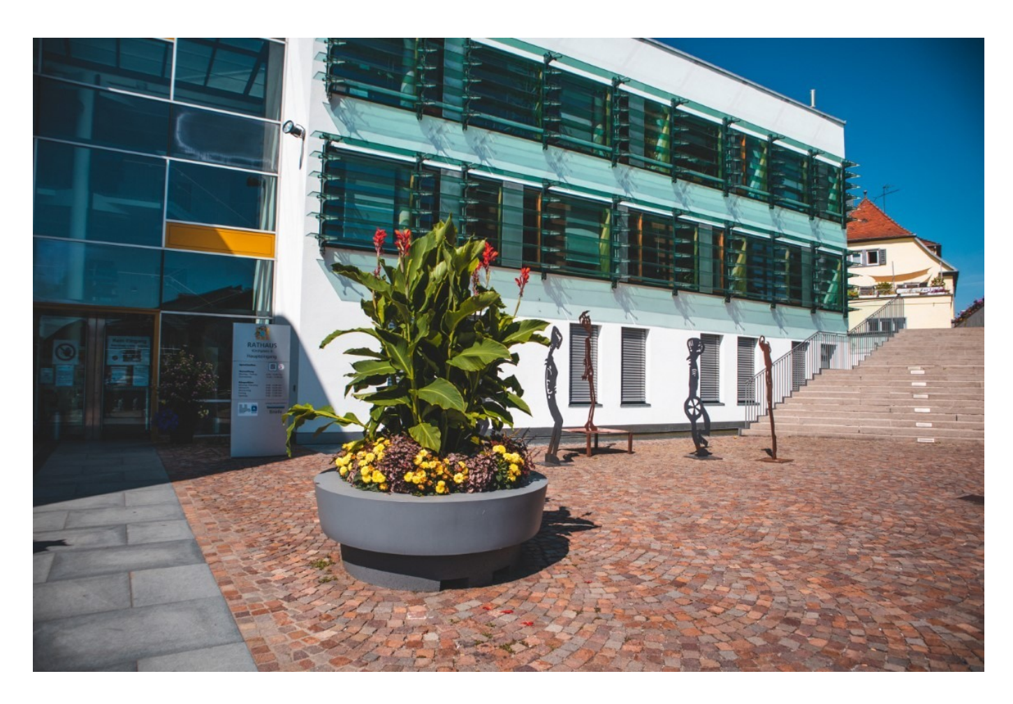
Bad Rappenau, Germany

The lack of soil is not an obstacle — in the town of Bad Rappenau there are both extensive palm trees and lush cannas. It was possible thanks to the use of specialized tools. Really large pots (the classic Gianto model and its variant with a seat) turned out to be capacious enough to provide the plants the right conditions.