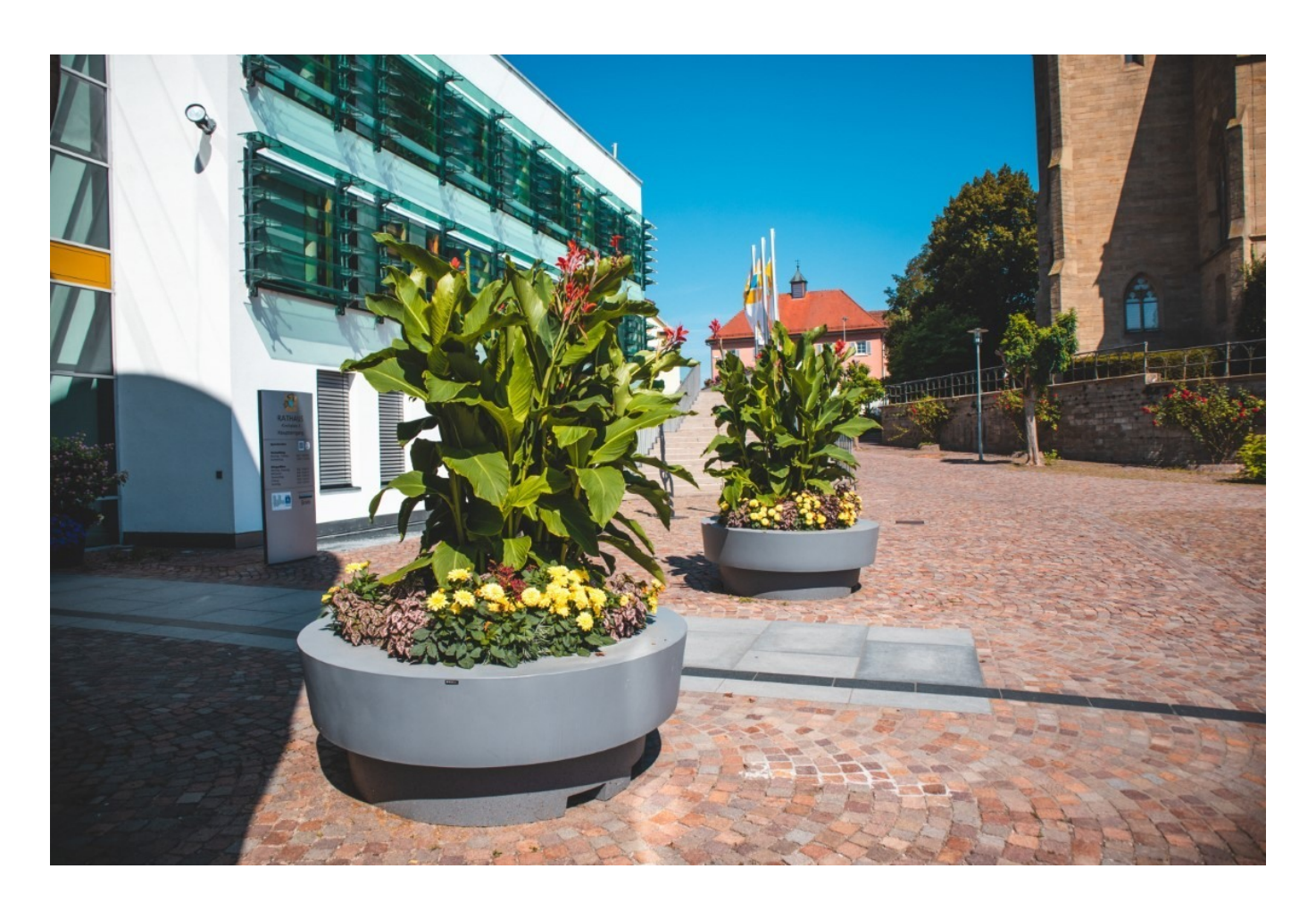
Bad Rappenau, Germany

It would seem that bushy ornamental plants are an option only if planting directly in the ground. It turns out that the most beautiful specimens can be easily grown in containers — provided that they are really large containers. A palm tree or cannas in the center of a paved square? No problem!