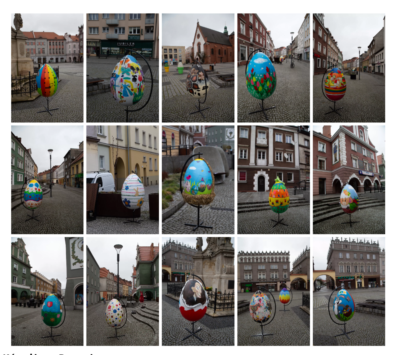
Kórnik - Brzesko:

The Brzeski Rynek came alive with splendid decorations — large Easter eggs. Purchased by the City Hall, they were adorned by local artists collaborating with the Municipal Cultural Center's staff. Ranging from a 1.5-meter giant to few others at 75 centimeters each, these Easter decorations not only beautified the surroundings but also infused the residents with a festive spirit, emphasizing the beauty of community and local collaboration.