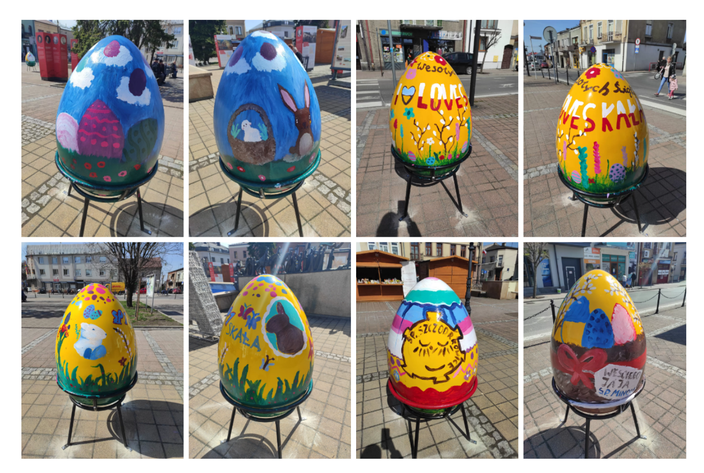
Beyond our borders, Easter eggs journeyed all the way to Bad Wimpfen in Germany:

An intriguing project involved the local government ordering white XXL eggs, distributed to various institutions. Early school children had the chance to collectively adorn them, expressing their boundless creativity. The youngest ones even left their handprints on painted Easter eggs. The delightful results await your admiration below.