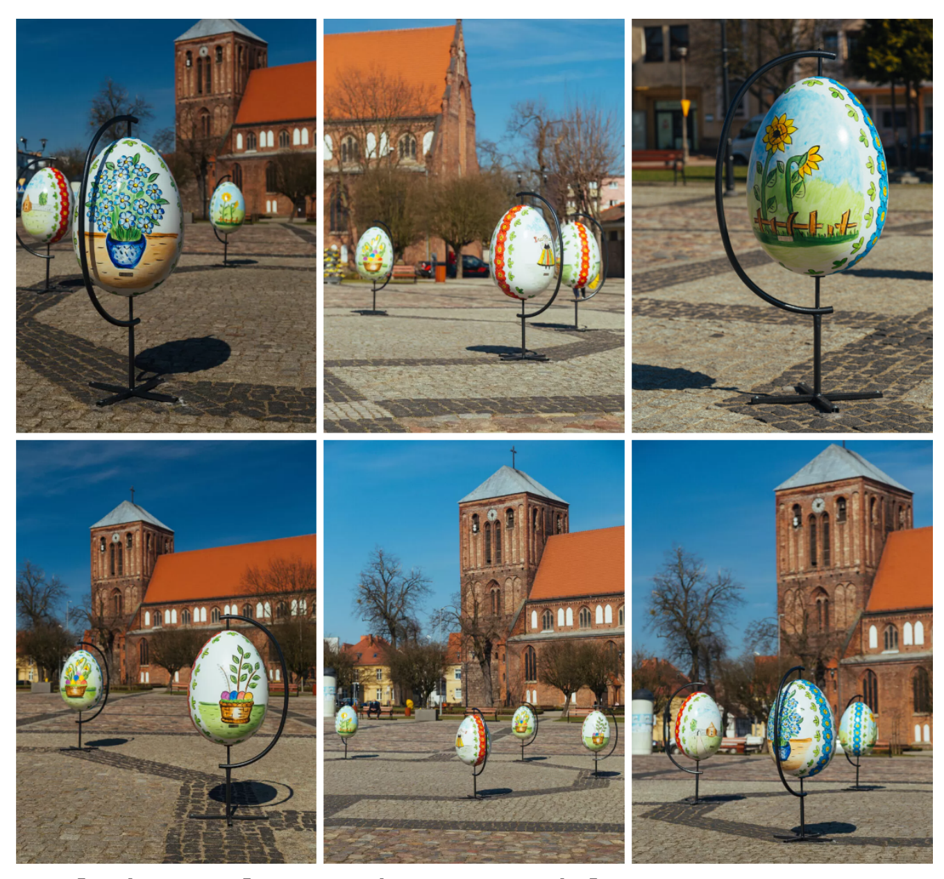
Now, let's travel to another town — Skała:

Skała hosted a competition where students formed teams of eight to embellish XXL Easter eggs. The results of their collaborative efforts adorned the market square. Marvel at the magnificence!