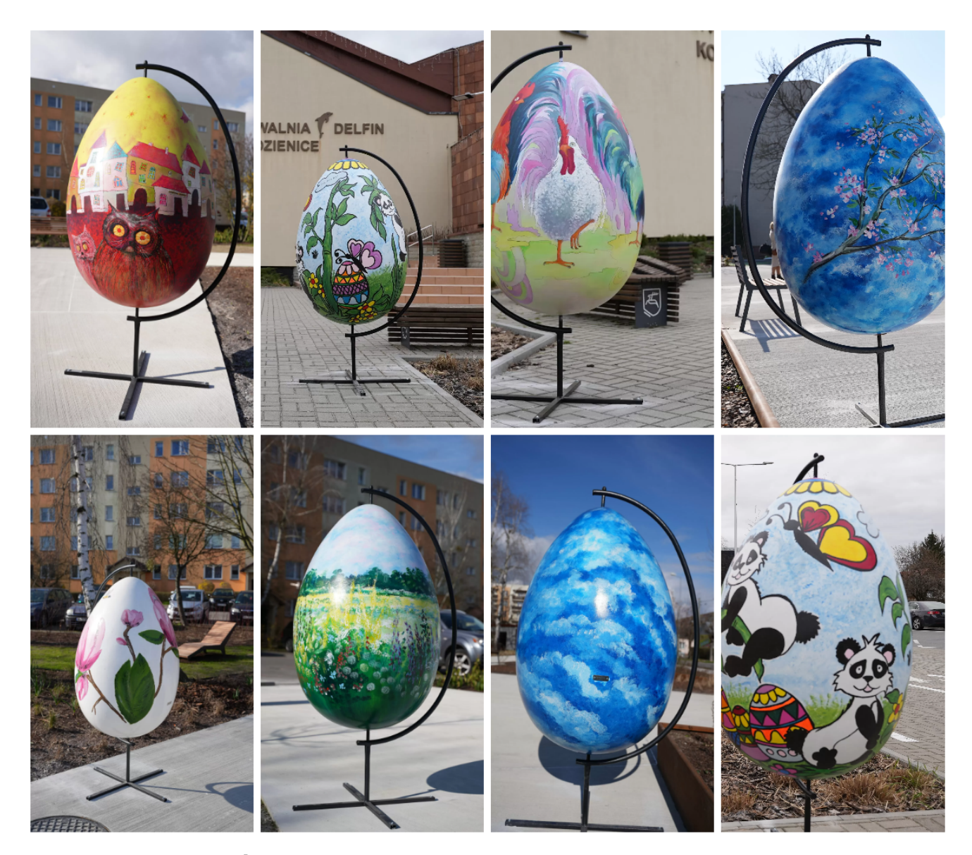
Next stop - Racibórz:

Racibórz entrusted its residents, who wholeheartedly embraced the initiative to paint extra large eggs. Witnessing the explosion of colors and the outdoor gallery, one can't help but appreciate the fantastic idea!