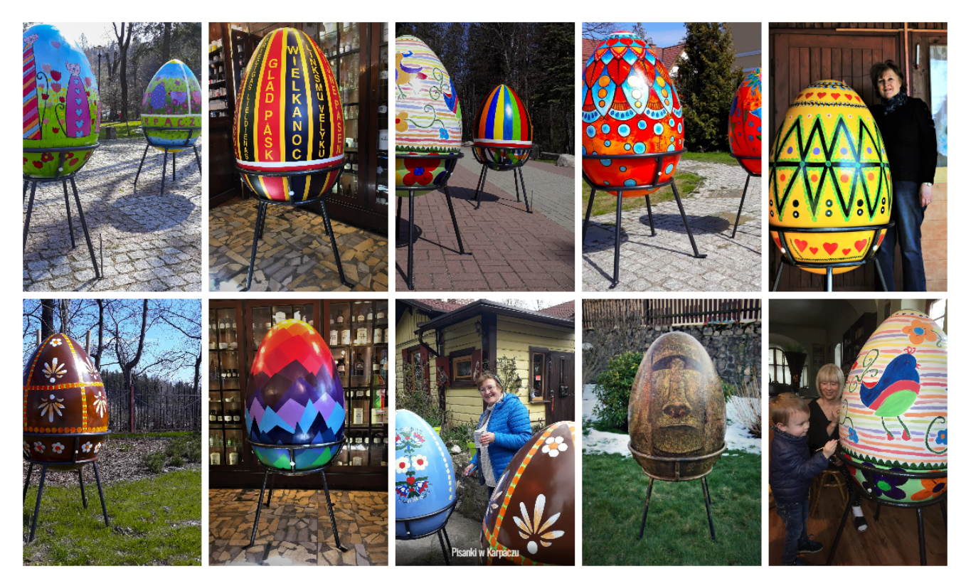
Now, let us introduce you to the town of Kozienice:

with modernity. A testament to the fact that unforgettable experiences can be crafted while preserving local culture