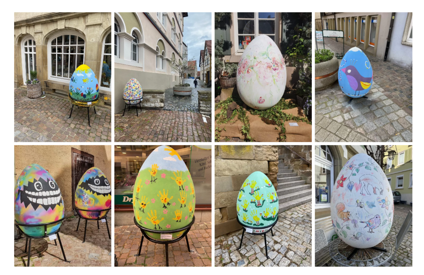
Finally, we venture beyond the Polish borders to Austria, to the city of Fürstenfeld:

The XXL egg painting initiative achieved resounding success, involving both young and old. Residents, local artists, school students, and art enthusiasts seized the opportunity to express their ideas and preferences through egg decoration. Each egg, a unique masterpiece, reflected the diversity of talents and imaginations within the community.