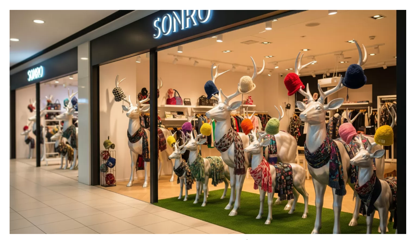
Order Your Own Custom Decoration - Step by Step

You don't need to be an interior designer to create something that will make your venue stand out. Ordering a fiberglass decoration is a simple, flexible process tailored to businesses just like yours. Here's how it works: