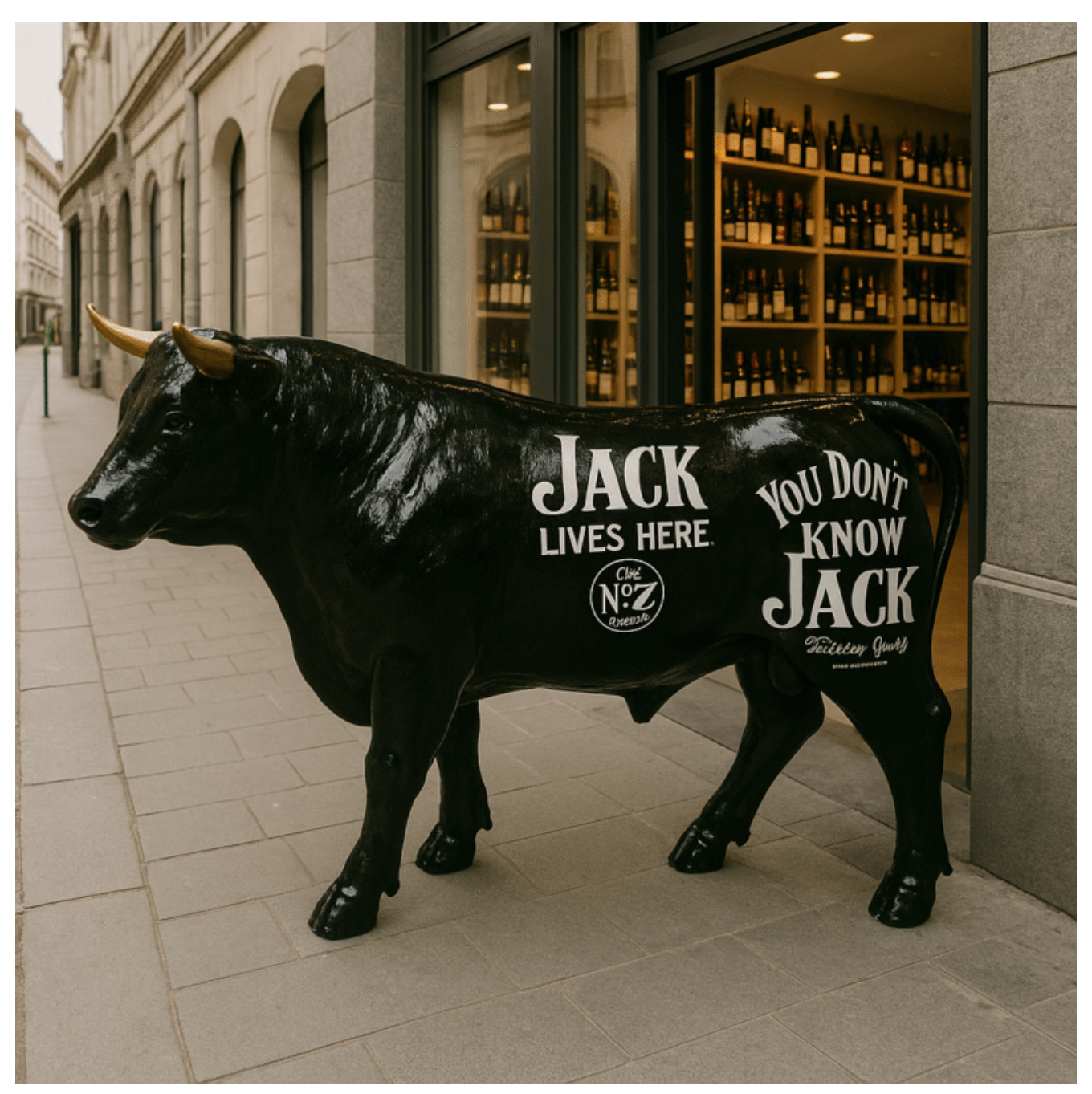
Creating "Instagrammable" Spaces — Free Promotion

Customers are more likely to return to places where they experienced something special or surprising.