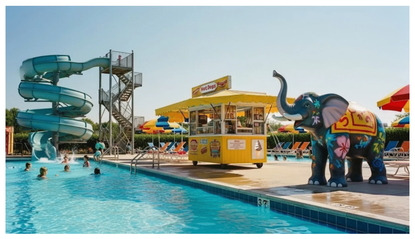
Why Is It Worth Investing in Eye-Catching Decorations?

In a world where first impressions matter most, well-designed decor can achieve more than the best advertising campaign. Large, eye-catching fiberglass decorations — from giant cupcakes to stylized animals — are not only extraordinary ornaments but, more importantly, powerful customer magnets for cafés, bakeries, hotels, and bars. They offer a unique way to stand out, build your brand, and create spaces that get people talking… and taking photos!