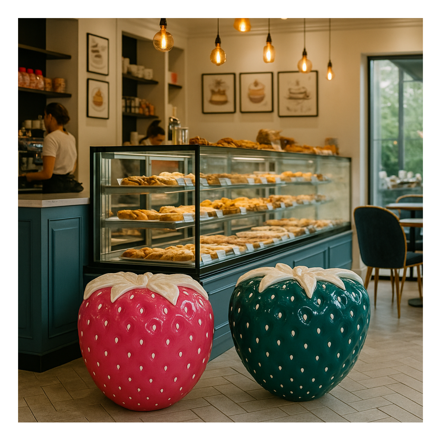
Indoor and Outdoor Use — Total Design Freedom

Thanks to its technical properties, fiberglass works perfectly in both indoor commercial spaces and outdoor settings — whether it's placed at your entrance, in a hotel garden, on a shopping center courtyard, or in an amusement park.