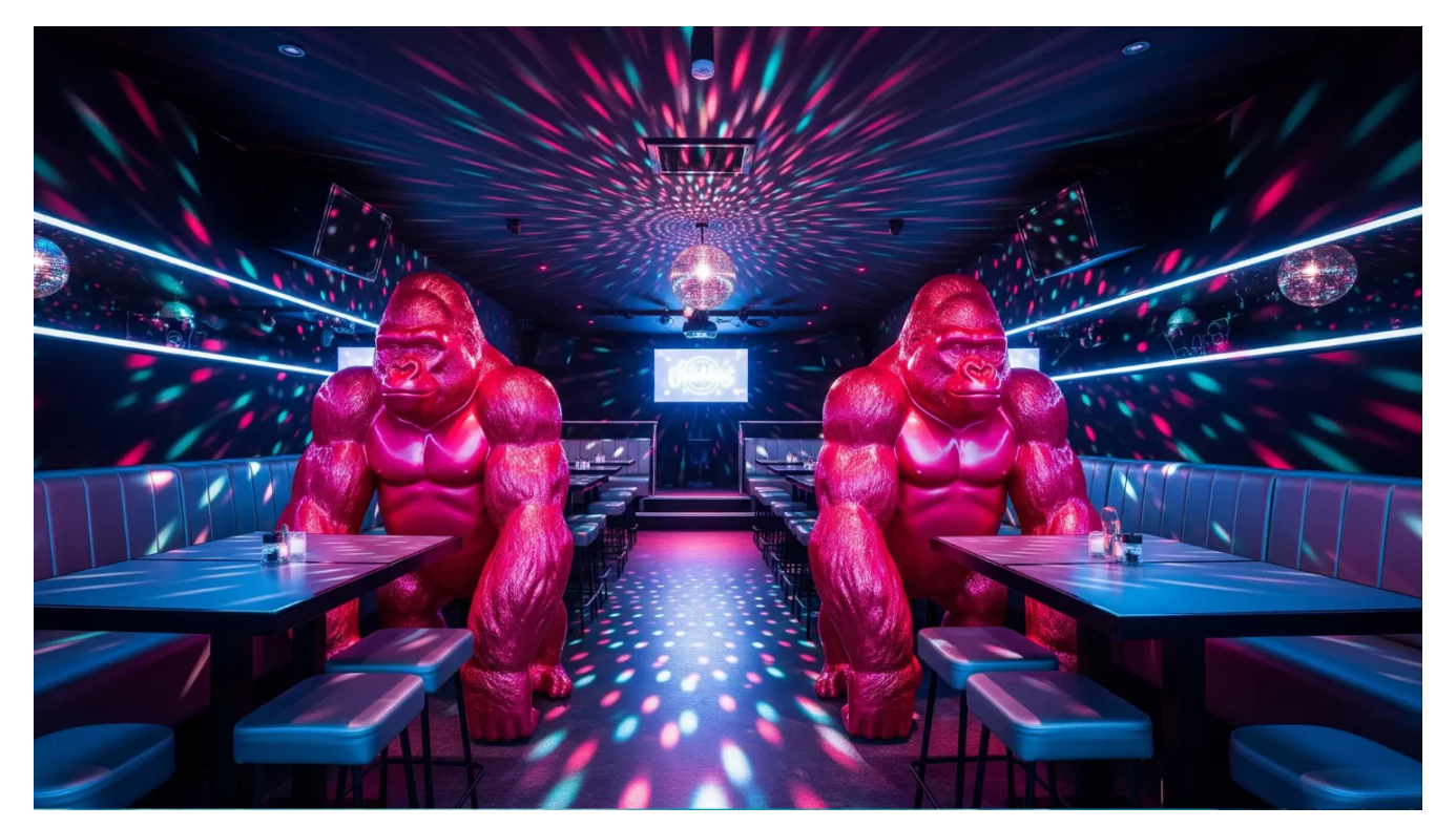
Creating a Recognizable Landmark

An unusual decoration can become a signature feature of your venue — the kind people talk about: "Oh, it's that café with the giant coffee cup outside."