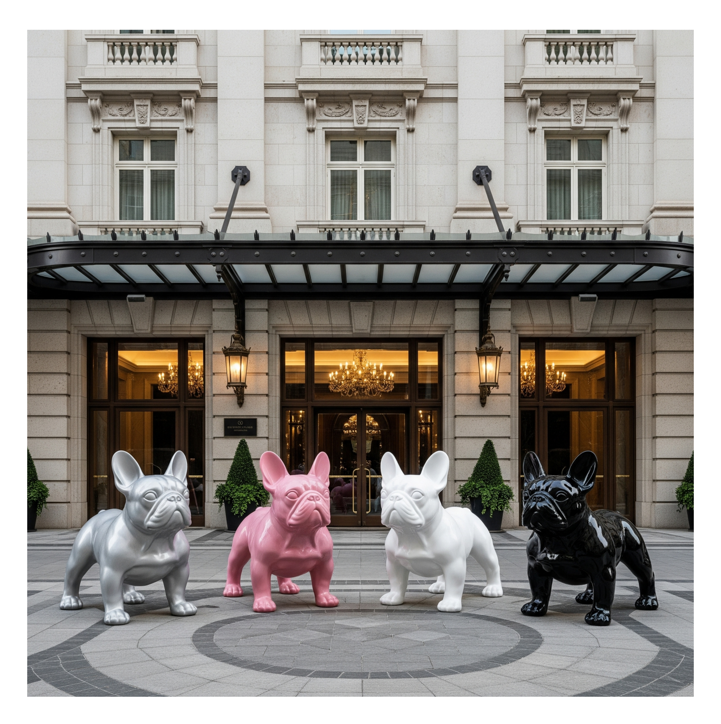
Why Do Customers Take Photos... and Come Back?

Customers love to share their experiences from interesting places — especially if those places look great in photos. Sculptures shaped like cupcakes, coffee cups, or balloon animals are practically "ready-made photo ops."