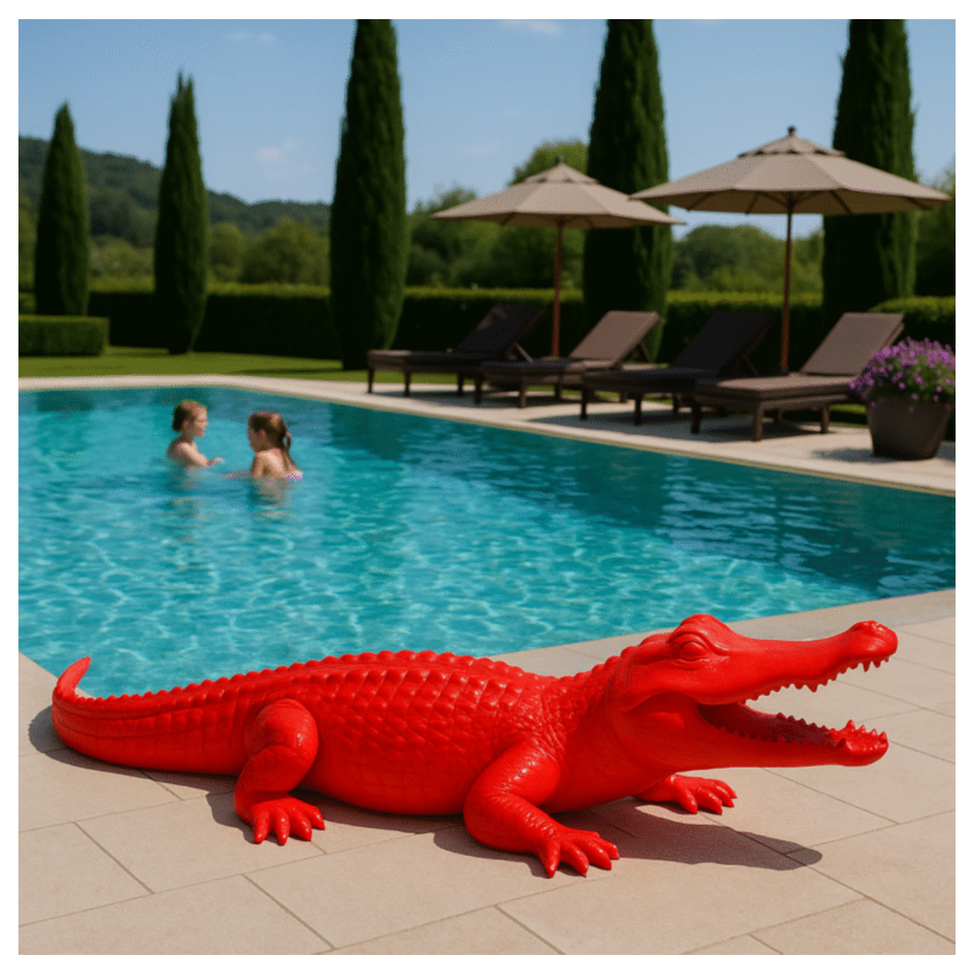
Transport and Installation — Stress-Free and No Surprises

Tip: Ask for a free visualization! — it will make the decision easier and ensure it fits perfectly with your décor.