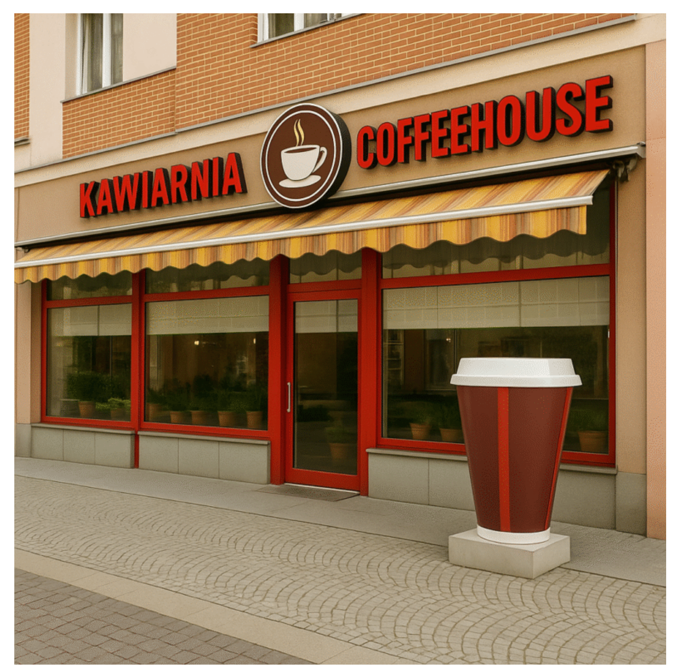
The Power of First Impressions — You Only Have a Few Seconds

matters more than ever. Here are three key reasons why fiberglass decorations are more than just ornaments: