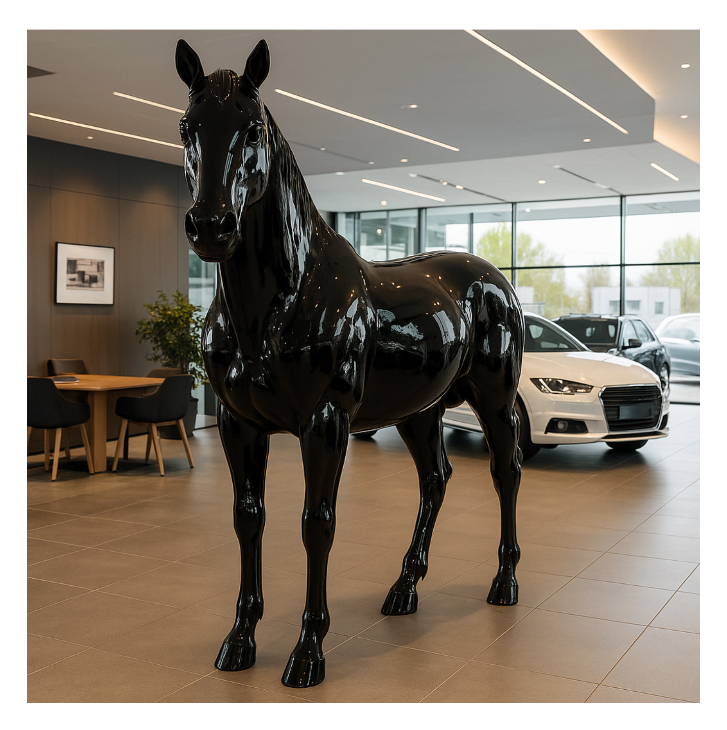
Unlimited Shapes and Colors — Creativity Without Limits

Fiberglass makes it possible to bring even the most imaginative shapes to life — from stylized animals and oversized everyday objects to abstract forms. A wide range of finishes is available too — matte, glossy, metallic — along with the full RAL color palette.