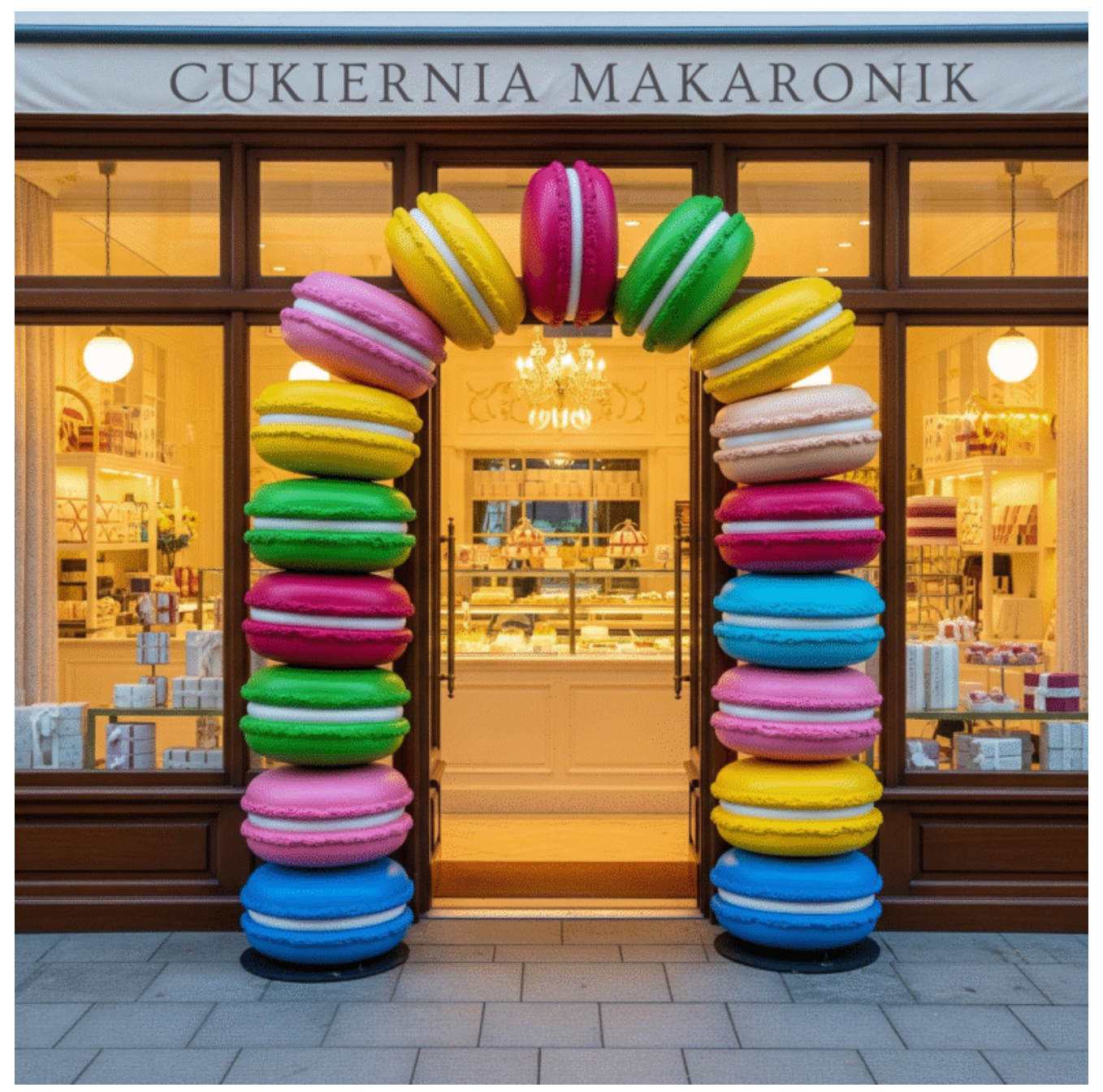
Influencing Customer Behavior - Stay in Their Memory

It's a simple change that can significantly increase the number of people who step inside "out of curiosity."