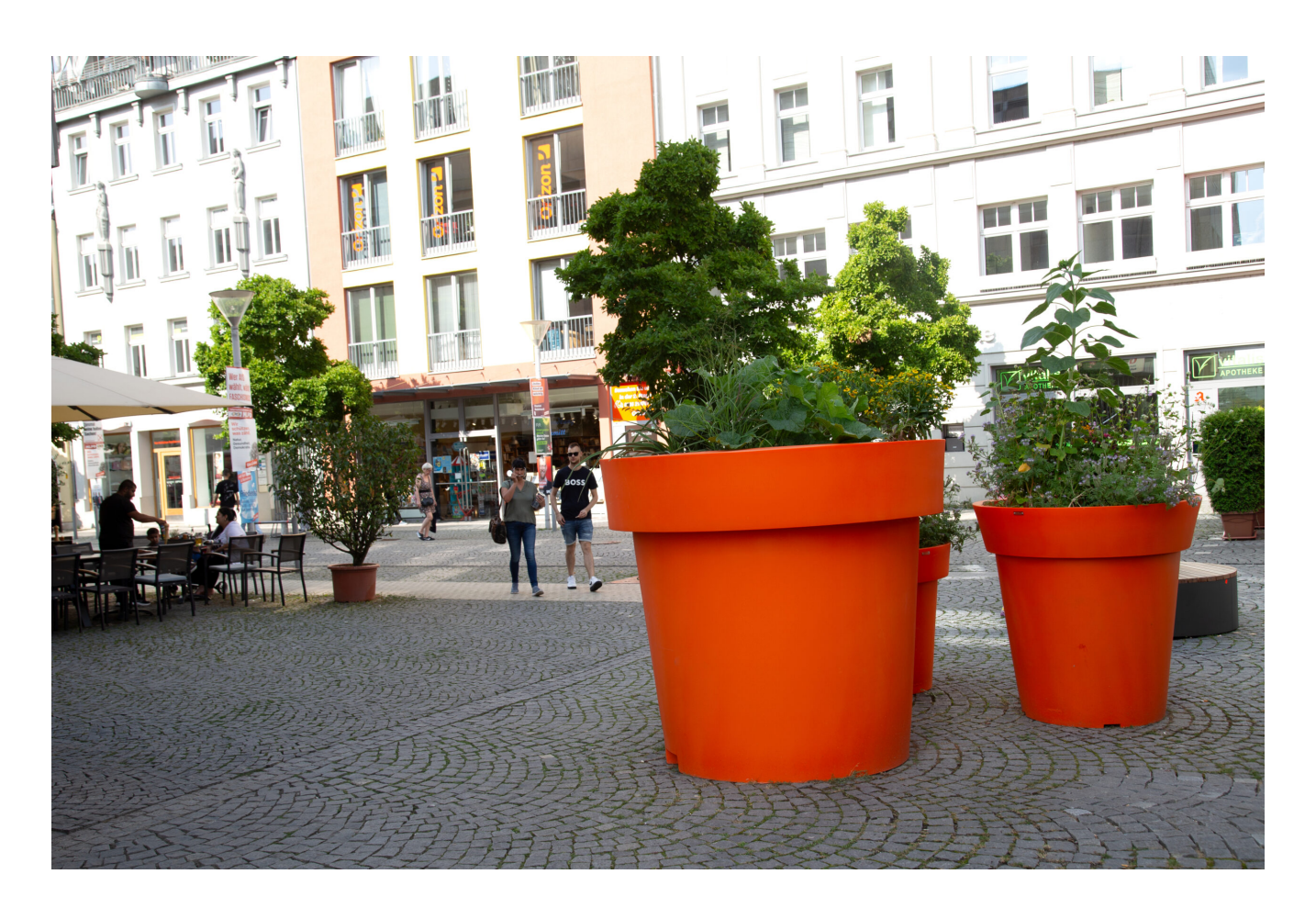
Why are polyethylene planters such a great choice? Here are some of their advantages: