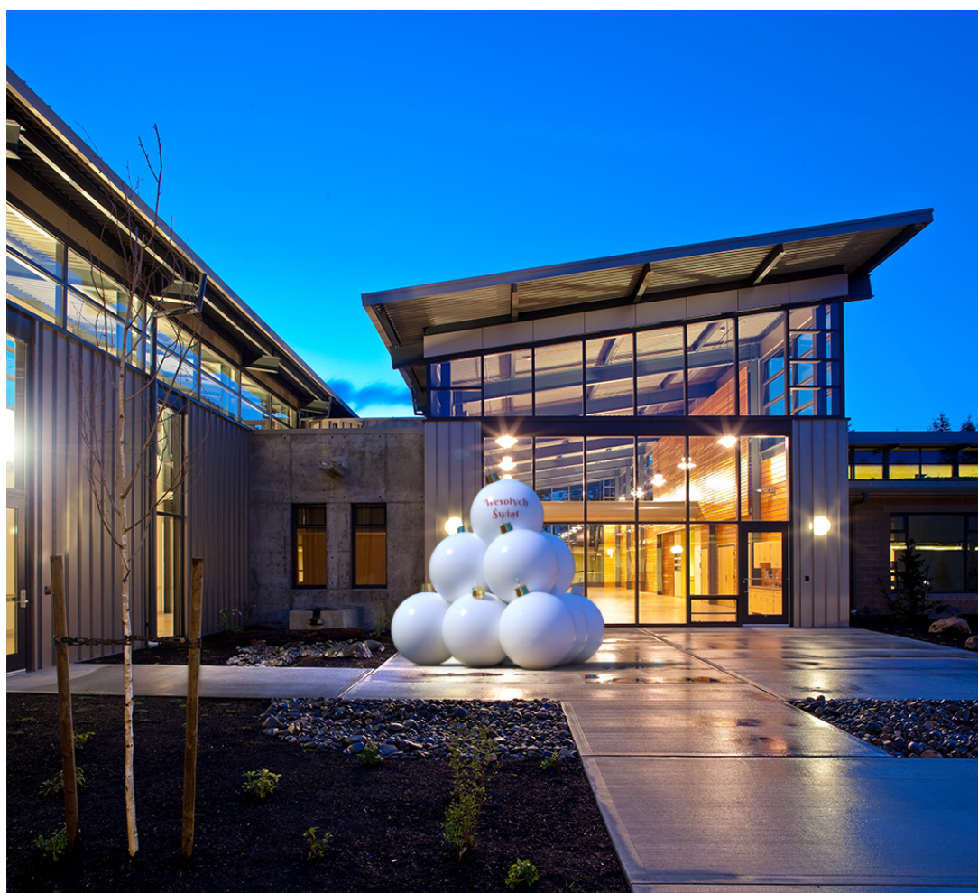
Pyramid of Christmas baubles in front of the hotel entrance.

Christmas decorations appear in houses, on city streets, but also in restaurants, shopping centers and hotels. While creating a delightful arrangement in your own home is simple and pleasant (as you can find beautiful, atmospheric accessories in every store), in the case of larger spaces, choosing the right Christmas decorations can be a bit more difficult. In this post, we'll show you how to decorate a hotel, both inside and out.