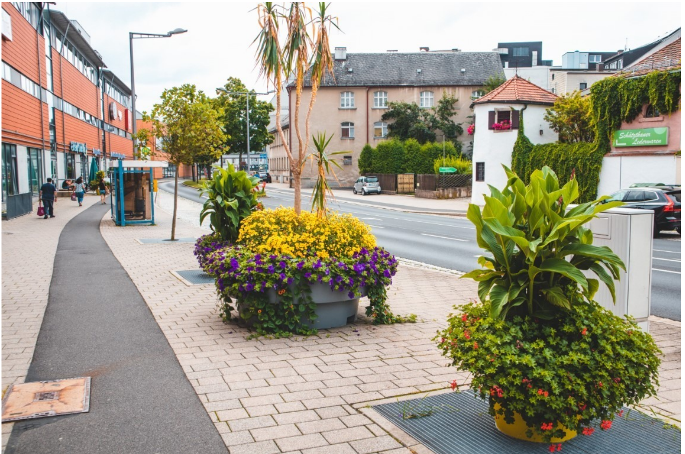
Marktredwitz, Germany

Such a solution was taken advantage of, among others, in the German city of Marktredwitz. Gianto city pots , models in the most intense colors, have appeared directly on the streets. Interestingly, such a choice is dictated not only by a purely aesthetic concept – vivid colors are better seen by drivers, which in turn improves their alertness on the road. The smooth texture of the pots also favors their exposure directly along the streets as dust and dirt easily disappear with rainfall.