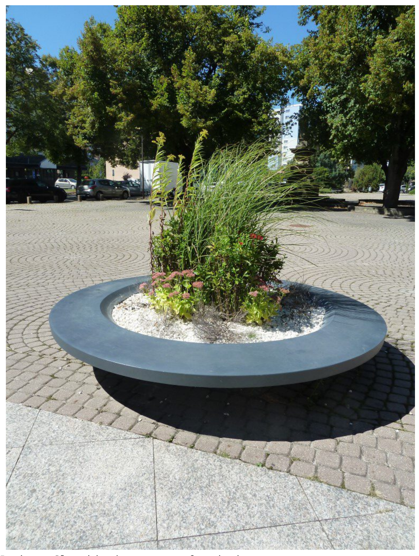
Puchov, Slovakia | www.terraformdesign.eu Where nature does not reach

Places defined as problematic — meaning without ground or cut