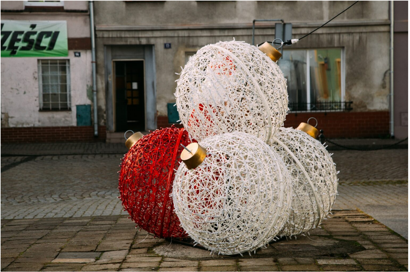
Pyramid made of openwork ornaments.