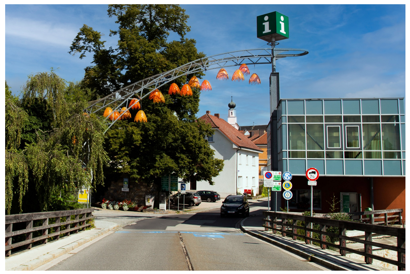
Welcome sign in Schärding – created from orange hanging decorations.