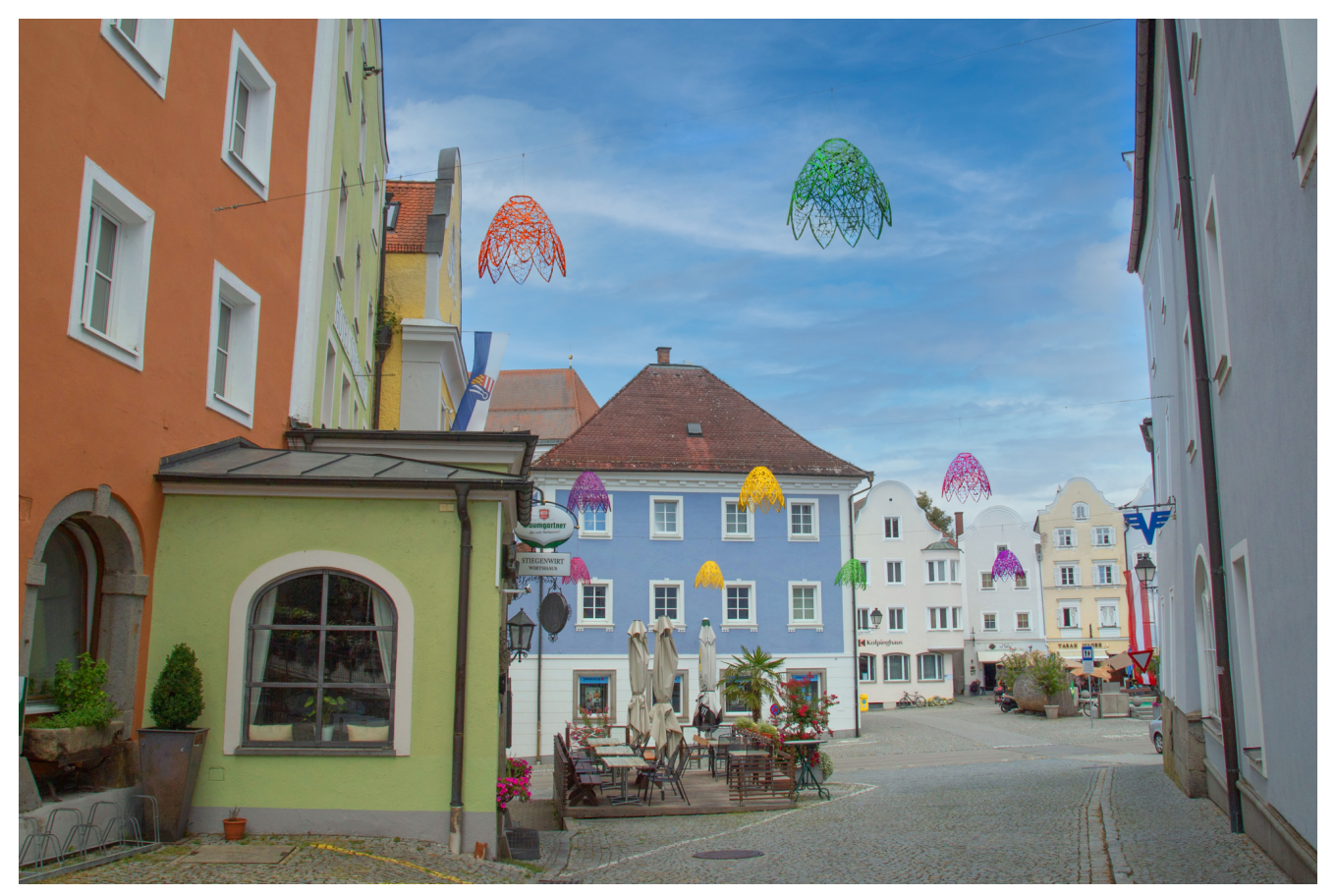
Streets decorated with hanging ornaments.