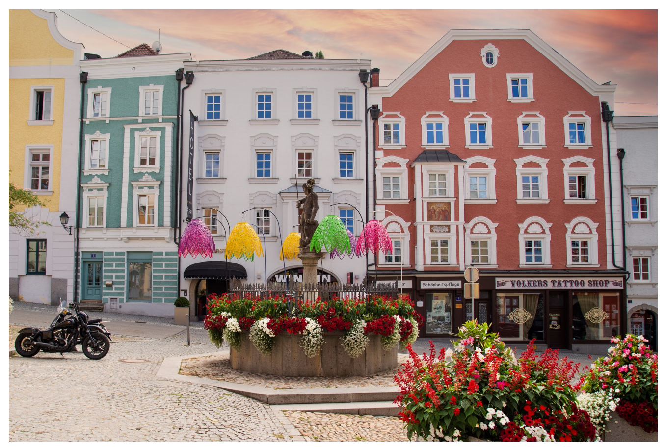
The monument adorned with colorful outdoor decorations.