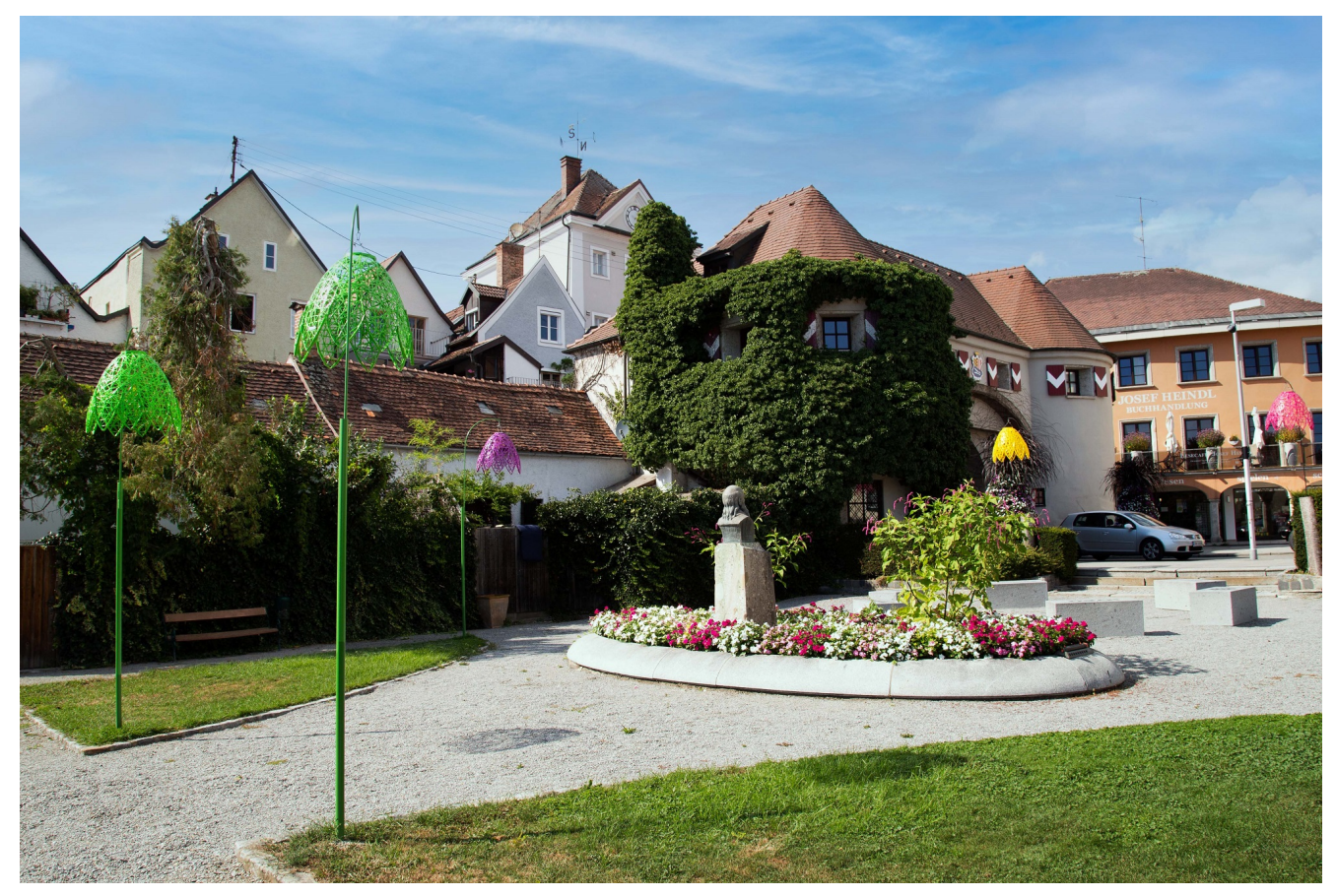
Flower square and hanging decorations.