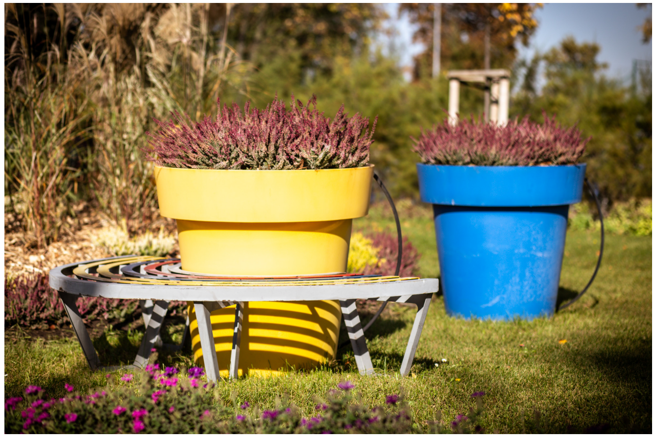
Heather is one of the most popular autumn plants. It appears in the garden, on the terrace, but also in public space.