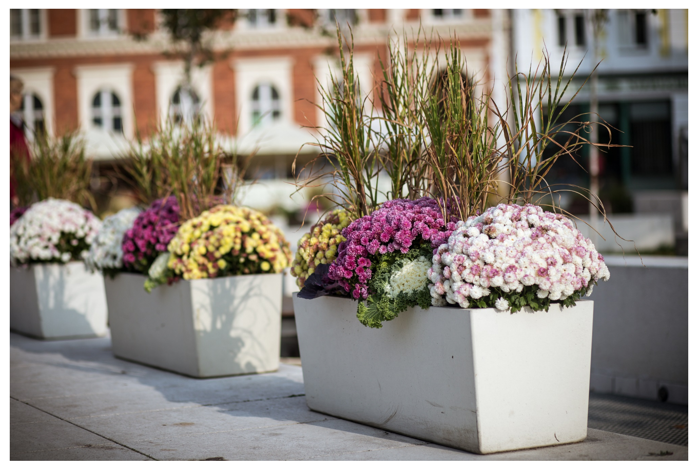
It is enough to reach for a few ingenious solutions to make the area delight with colors, even until the first frost.