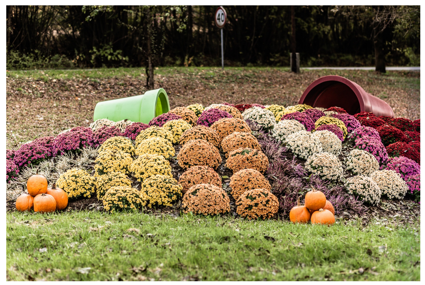
The original use of pots in an autumn arrangement.