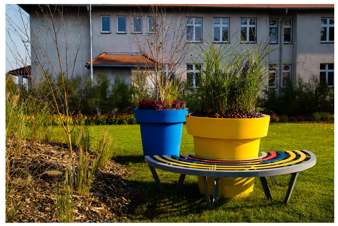
Fall planters with chestnuts.