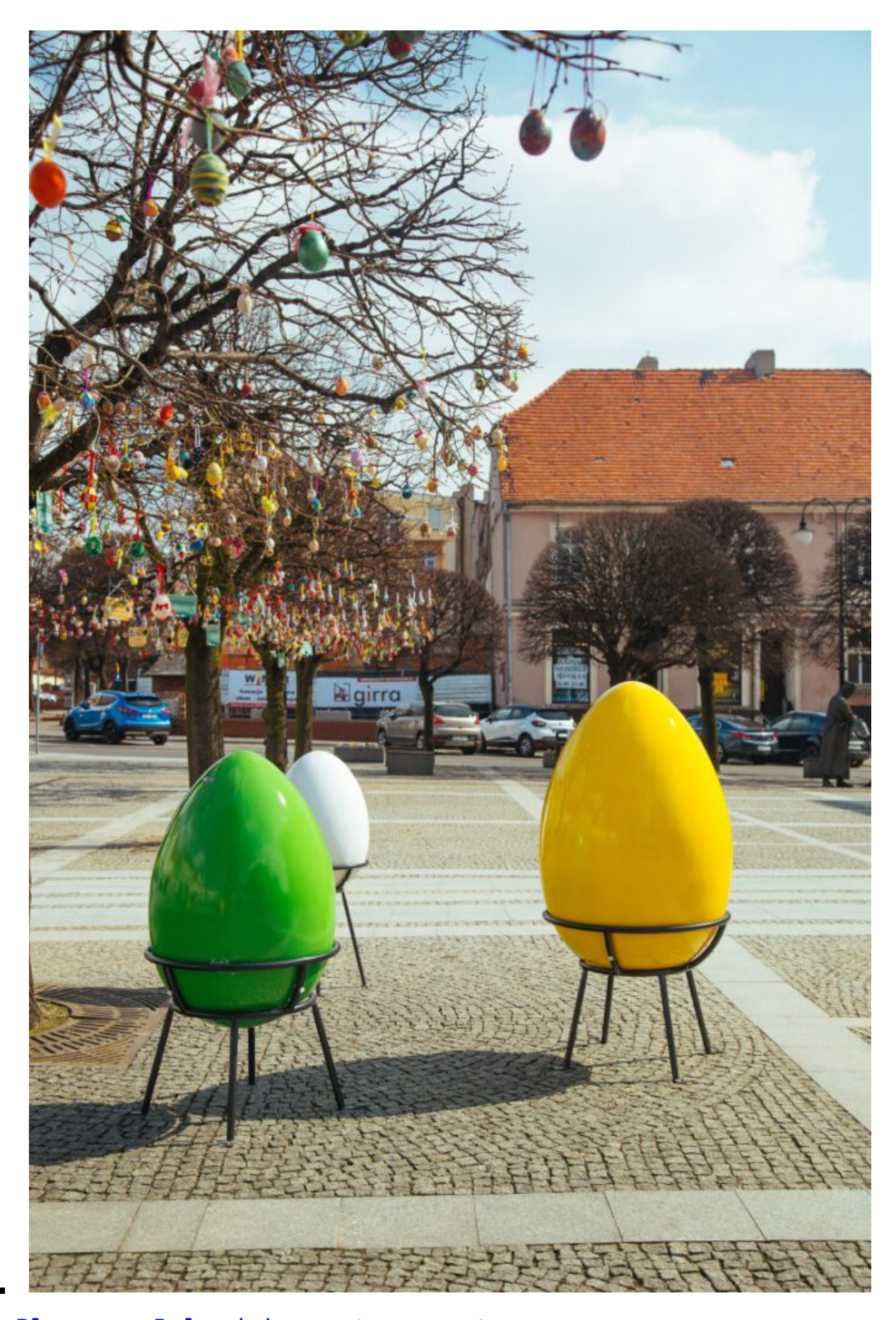
Pleszew, Poland | www.terraeaster.com