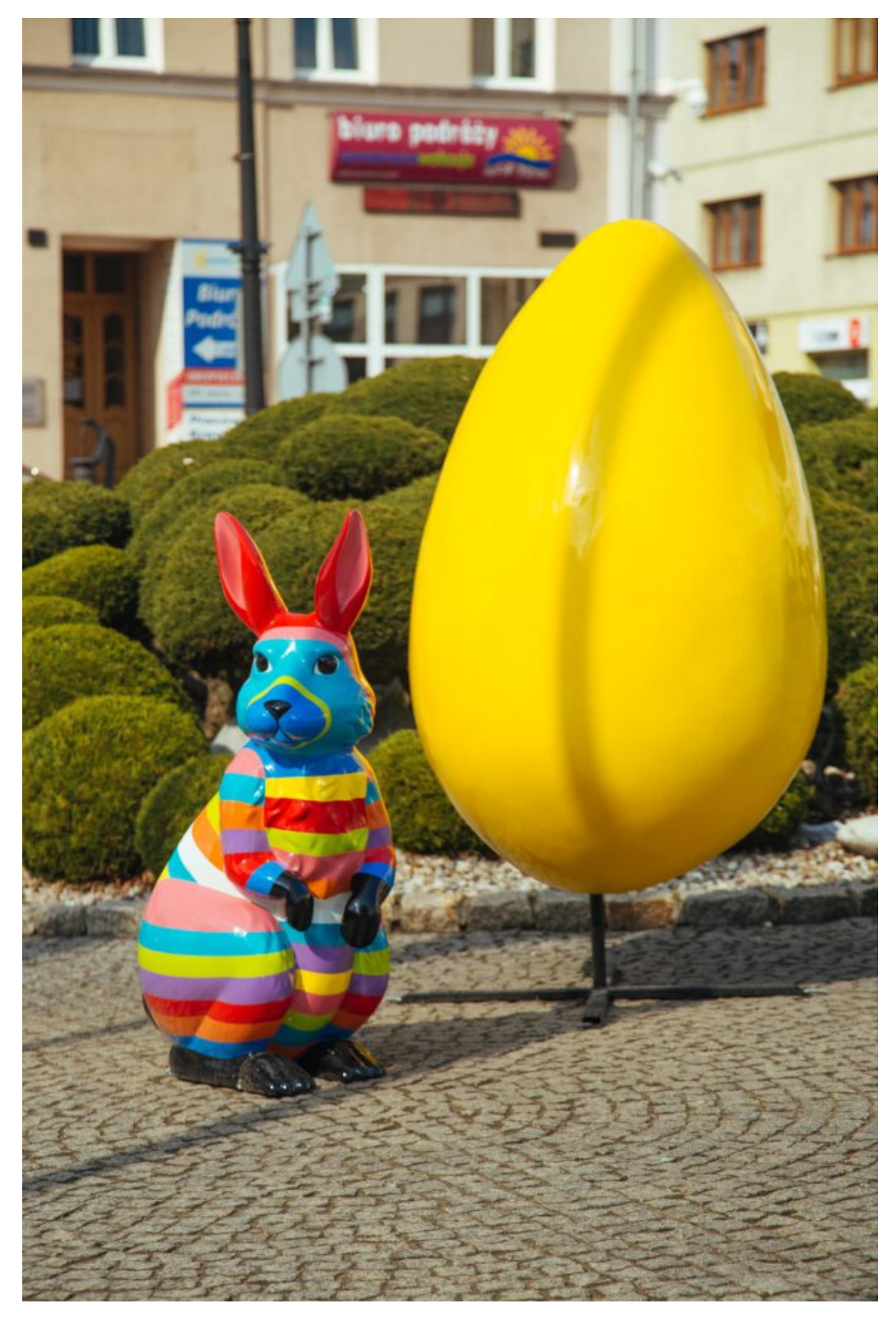
Pleszew, Poland | www.terraeaster.com