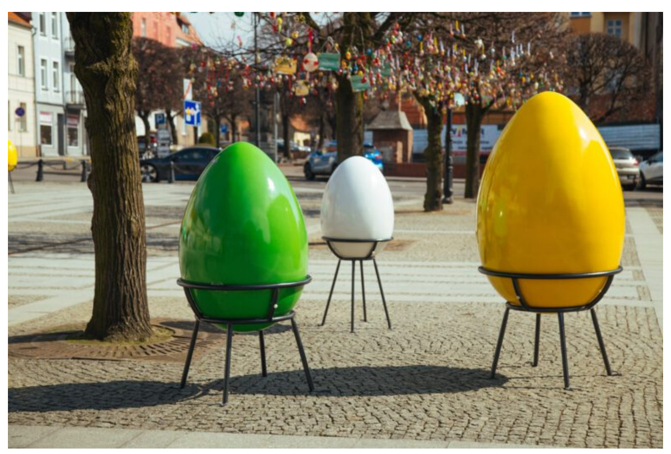
Pleszew, Poland | www.terraeaster.com

unusual atmosphere. While many aspects of life have changed, fortunately we can still enjoy what makes up our identity. Traditional symbols belong to this group of such accents. Therefore, there are manyappreciated Easter symbols in city squares — in Pleszew we could admire not only the hand-made works of the youngest residents, but also macro-scale decorations, including XXL Easter eggs. This beautiful composition allowed passers-by to break away from the restless reality, at least for a moment.