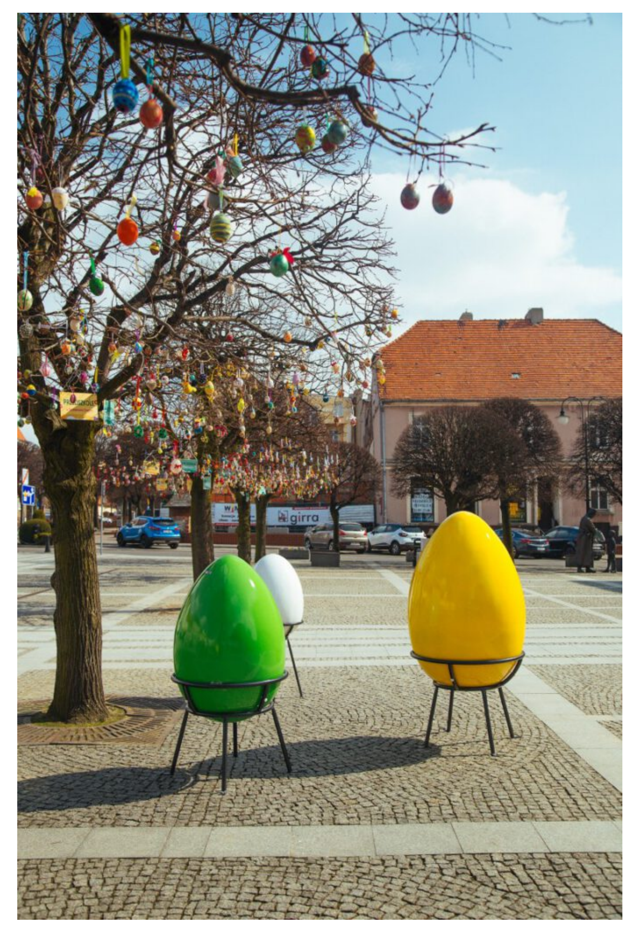
Pleszew, Poland | www.terraeaster.com