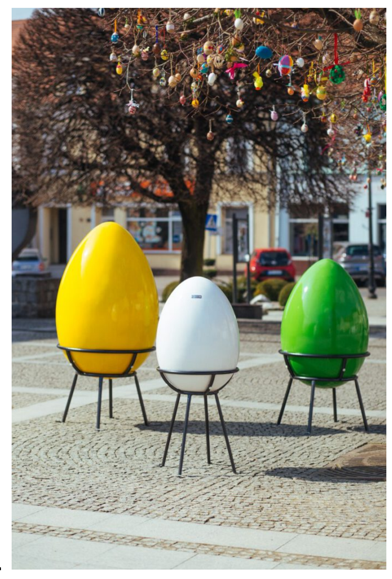
Pleszew, Poland | www.terraeaster.com