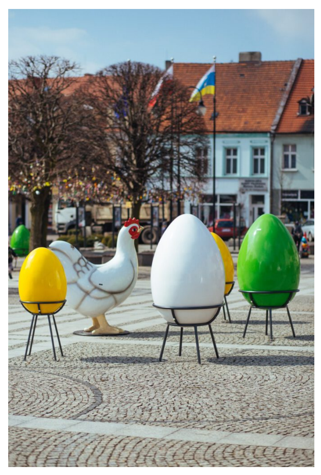
Pleszew, Poland | www.terraeaster.com