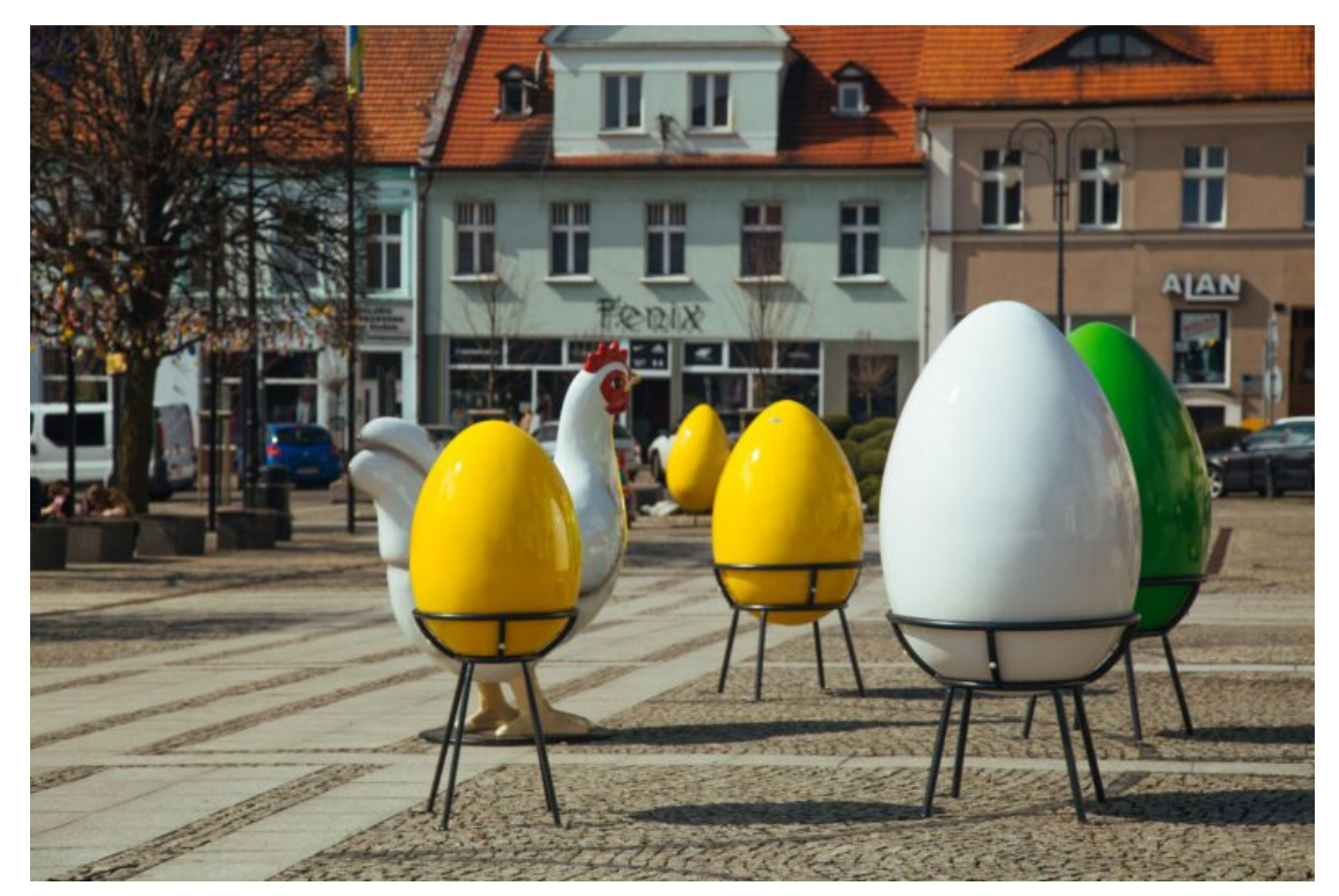
Pleszew, Poland | www.terraeaster.com

What else do cities gain if decide to use this type of Easter decorations? The elements can be displayed in various ways — on different stands, thanks to which the eggs can go anywhere. Many cities and towns have also decided to personalization, choosing stickers according to any design — but you will find out more about it in the next posts!