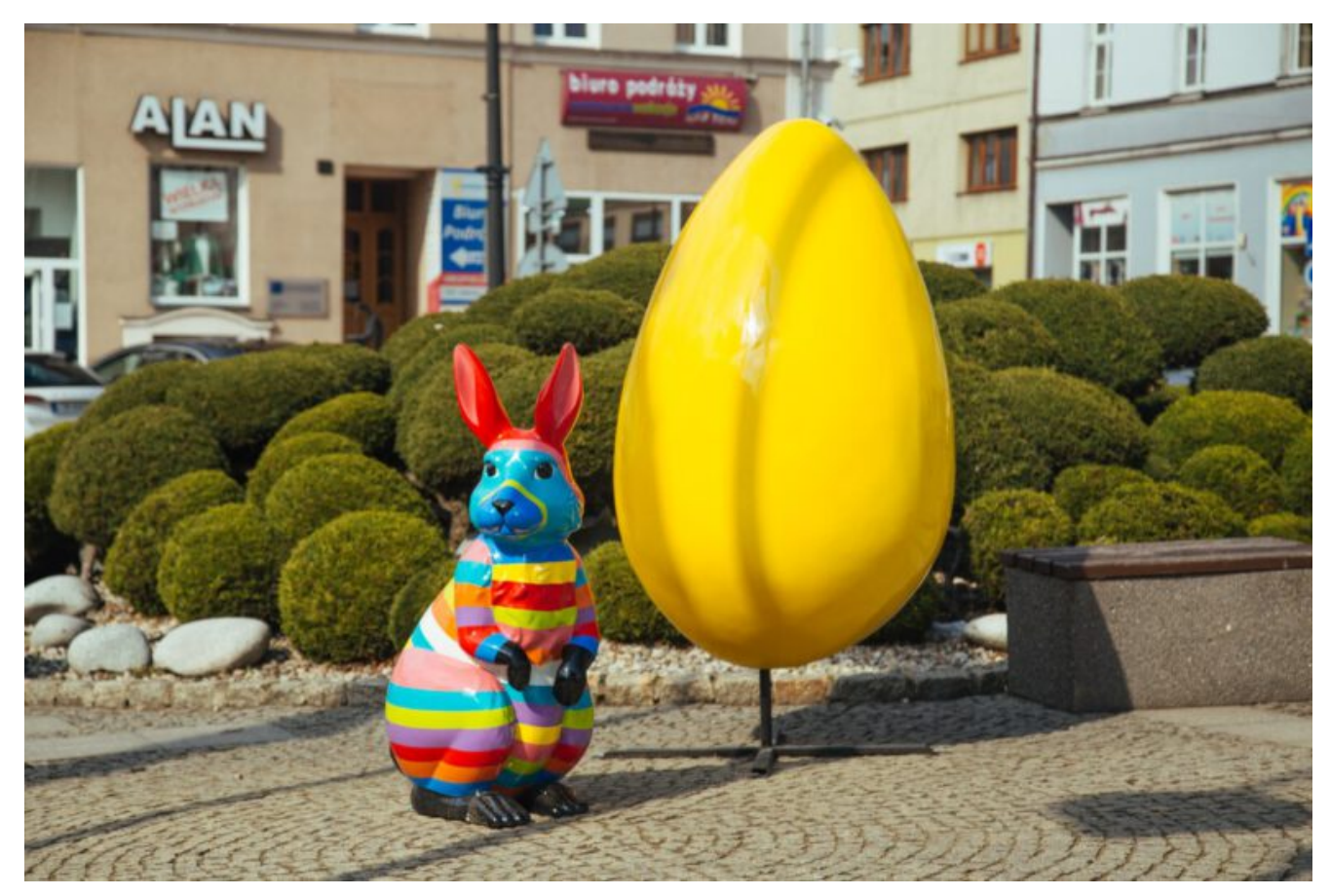
Pleszew, Poland | www.terraeaster.com