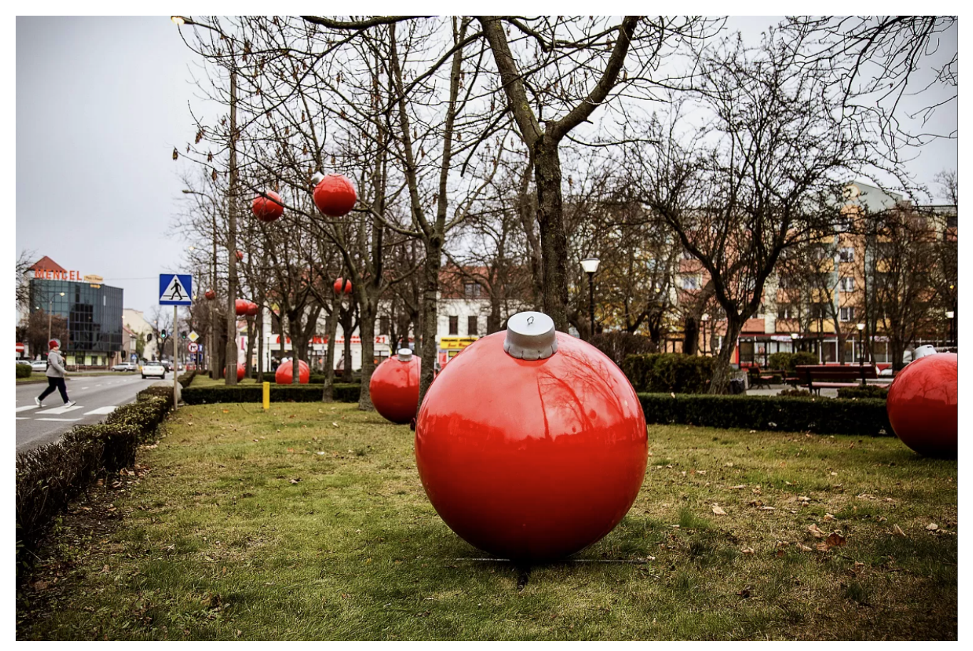
Size of outdoor Christmas baubles: standing 100 cm, hanging 50 cm. Realization: Słubice, Poland.