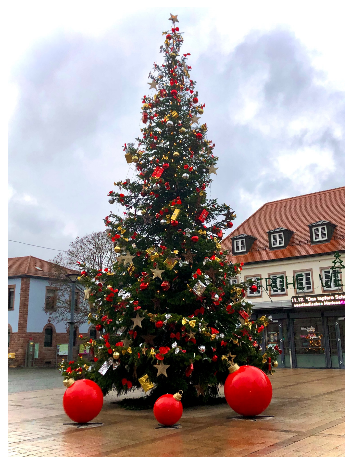
Size of oversized Christmas baubles: from left 80, 60 and 100 cm.