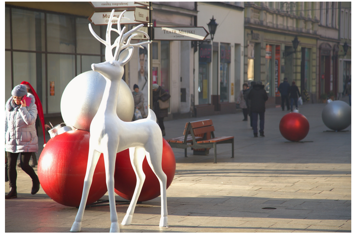
Size of oversized Christmas baubles: pyramid of baubles 100 cm, second plan red 80 cm and silver 100 cm. Realization: Leszno, Poland.

standing 120 cm.