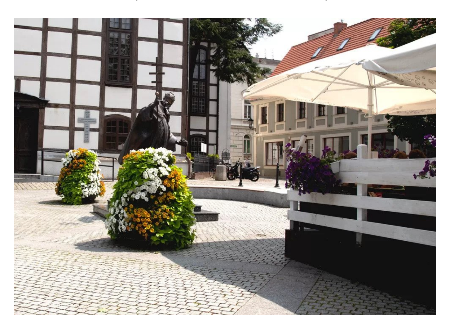
So, who of you is planning a trip to Zielona Góra? See you there!

The inhabitants of Zielona Góra are fortunate that their city is one of the greenest cities in Poland. This aspect directly affects the quality of life here and, and at the same time, influences the city's attractiveness for foreign tourists.